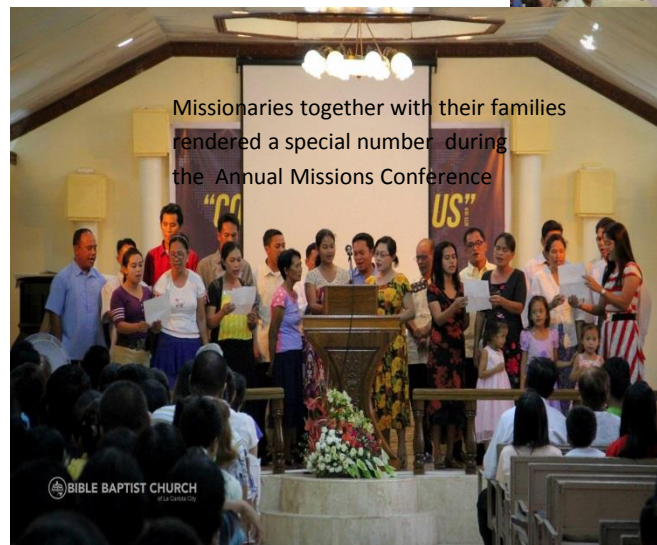
Missionaries together with their families rendered a special number during the Annual Missions Conference