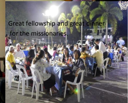
Great fellowship and great dinner for the missionaries.